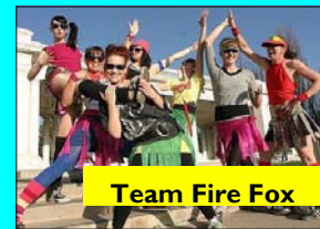
Team Fire Fox