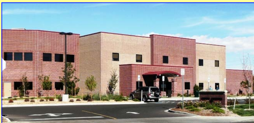
ICCS Weld Facility—Home of Greeley CEO