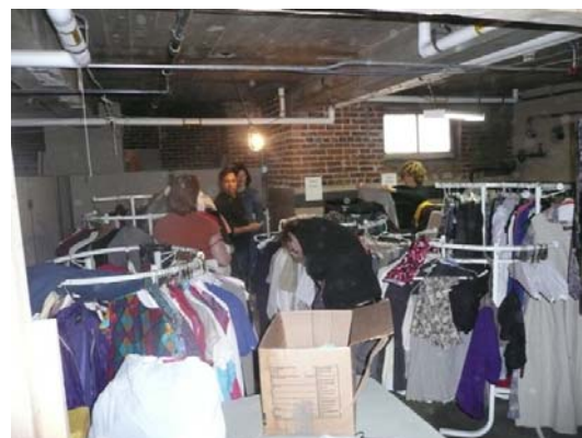
Clothes Closet CEO Lakewood